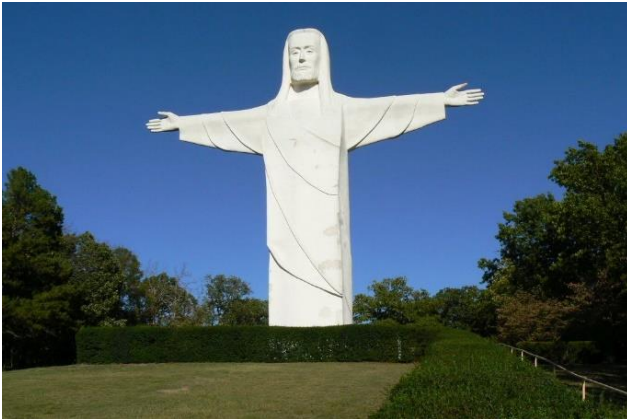
Christ of the Ozarks